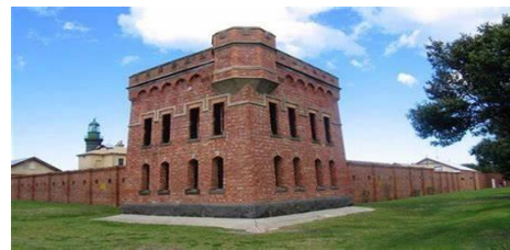
The Fort in Queenscliff